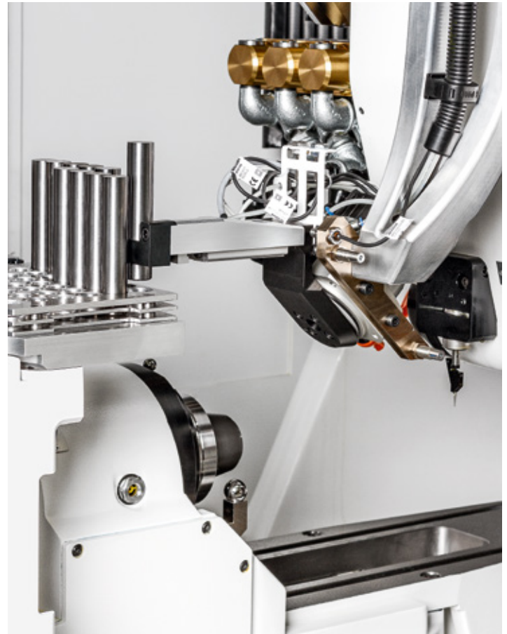
Option: Top loader

Walter Maschinenbau GmbH Jopestr. 5 · 72072 Tübingen, Germany Tel. +49 7071 9393-0 · Fax +49 7071 9393-695 info@walter-machines.com